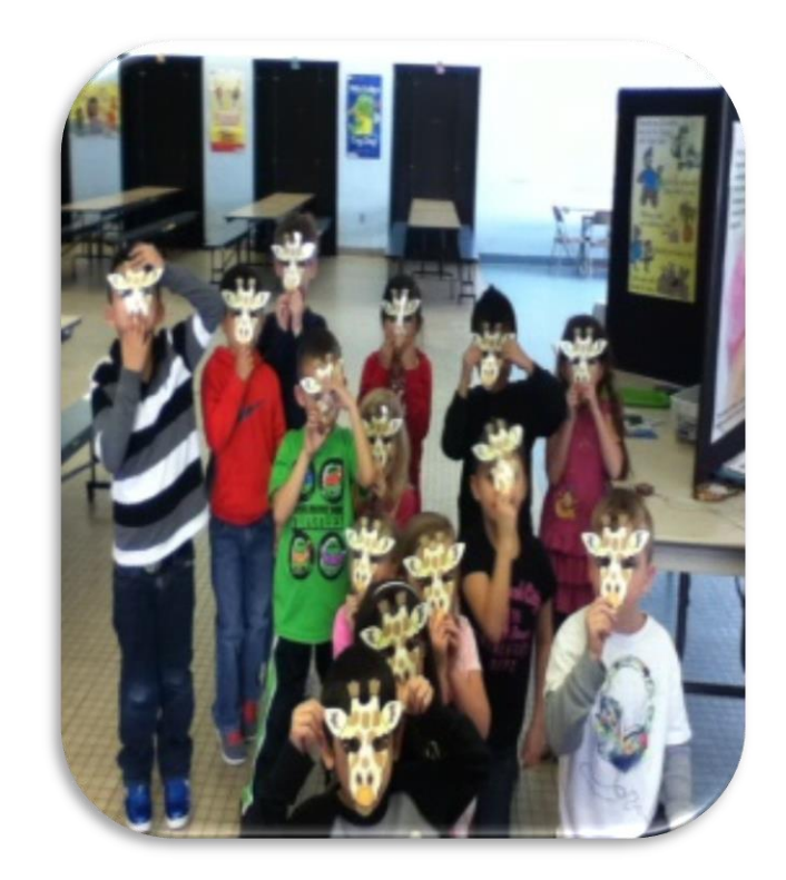
Book in a Bag