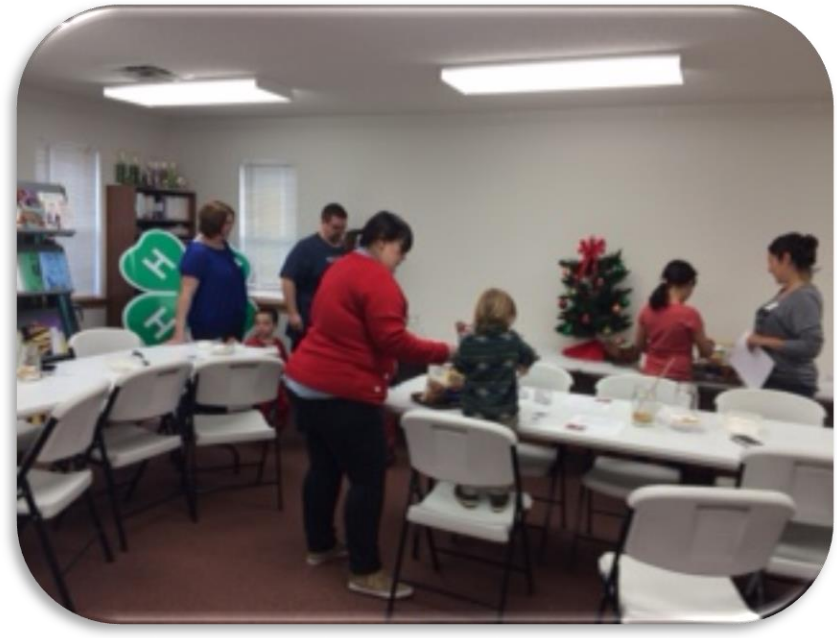
Summer Nutrition Classes at Grant County Recreation