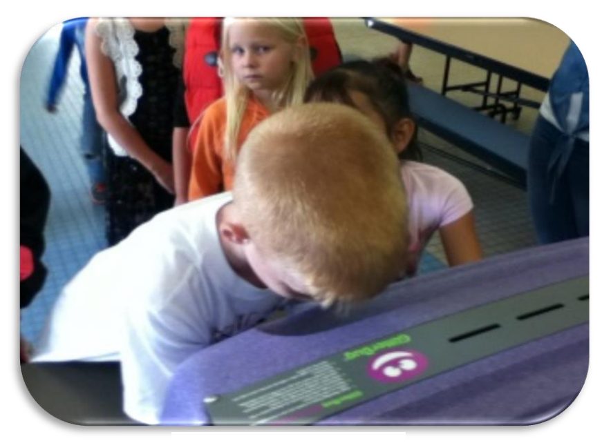
After School Program