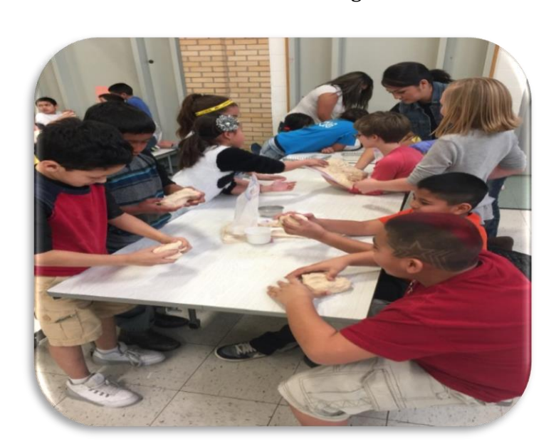
Show Me Nutrition Bread in a Bag